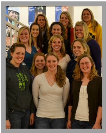
Members of the Illini ACT Chapter.

The Illini ACT chapter has been very busy this fall. From monthly meetings and social gatherings to professional development and networking sessions, Illini ACT members are truly experiencing the impact of opportunity.