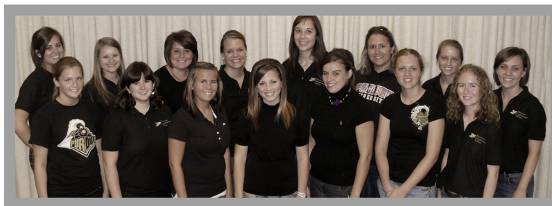
Members of the Purdue ACT Chapter.

With nearly 15 members signed up for PDC, the tough work began. The officer team devised a plan for