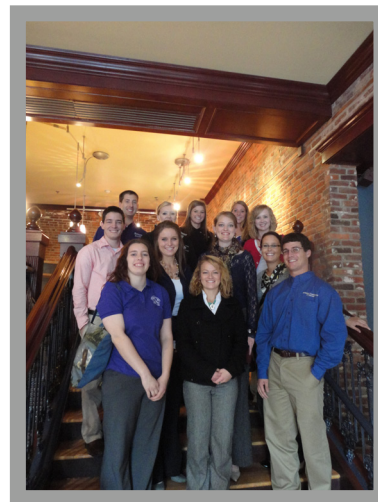
Members of Kansas State ACT after a successful Office Bombardment visit.